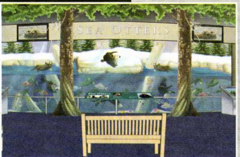
The sea otters at the Aquarium are getting a remodeled home — and some new friends. See story page 14.