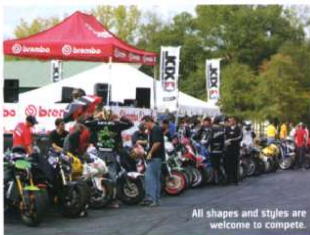
All shapes and styles are welcome to compete.