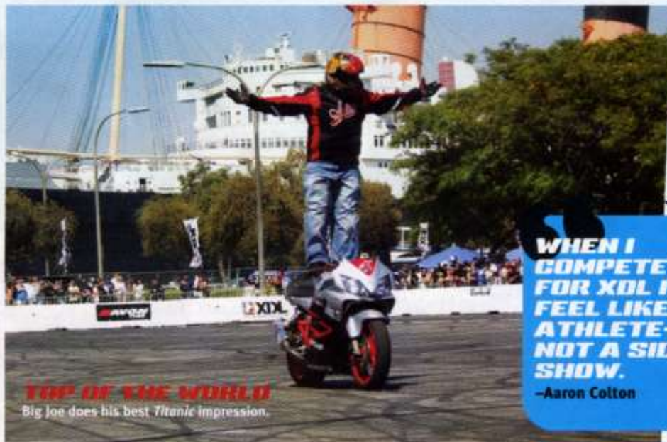
TOP OF THE WORLD Big Joe does his best Titanic impression.